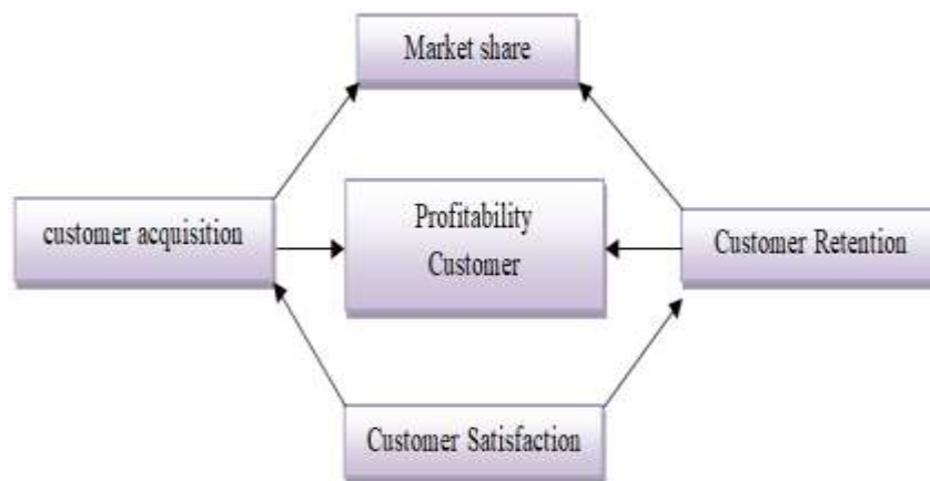
Figure 2. The customer perspective according to (Kaplan & Norton, 2000)

the competition among companies is unlikely to survive if there is no support from customers.