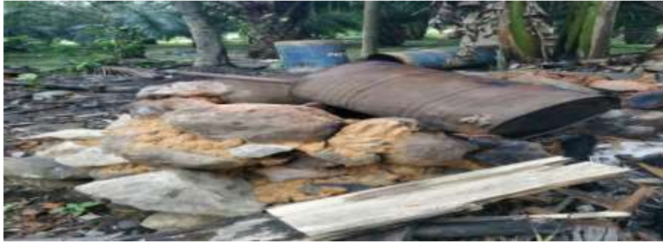
Figure 2. Patchouli Oil Receptacle Drum Containers

Utilization of technology and machinery by patchouli farmers in Meranti Tengah Village based on the observations of researchers is still not well utilized. The use of technology for weather and climate forecasting in the context of the planting process, identifying rainfall and others is also not well considered. Likewise with the use of a processing machine for dried patchouli leaves, namely distillation that is still done very simply without using the right machine. The distillation process uses only simple tools that are independently modified by farmers and are used together. Supposedly, the use of more sophisticated machines will make it easier for farmers to get maximum yields. By using machines such as Figure 1 and Figure 2, we can be sure that the yield from distillation of dried leaves will not get maximum results. The latest and sophisticated machine should be able to improve the distillation results because by using traditional machines like that is possible for the oil still contained in patchouli leaves will not come out perfectly. Therefore, the government's attention to patchouli farmers in the village of Meranti Tengah in terms of information assistance and the provision of distillery equipment is absolutely needed by farmers because based on the results of interviews, none of the patchouli farmers have ever gotten that.