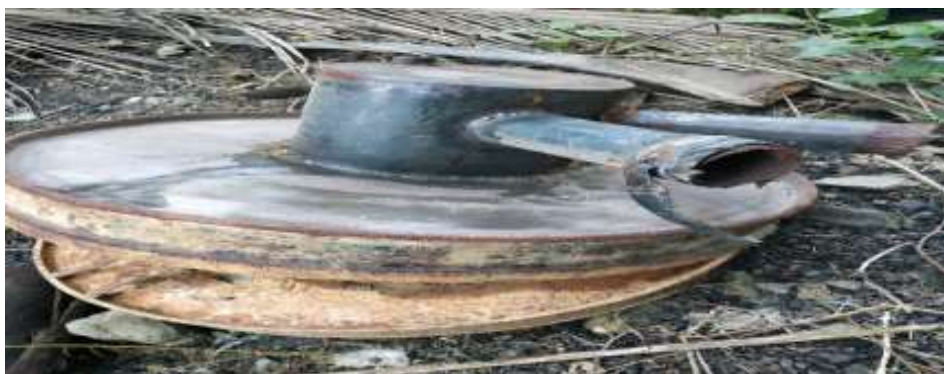
Figure 1. Patchouli Distillation Tool of Central Meranti Patchouli Farmers

Technology and machinery are important elements in expanding the scope of business. In businesses engaged in agriculture, the use of technology and machinery is absolutely necessary. Technology in agriculture can be used to predict climate and weather, while machinery can be used to streamline labor and time management before and after harvest. However, in patchouli farming in Meranti Tengah Village, the use of technology and machinery is still failing to be carried out due to the lack of technological understanding and inability to use machines or the price of machines that are too expensive.