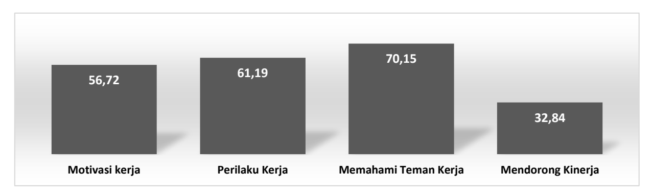
Figure 3. Benefits percentage of the Pumping HR model-Based HRD in Improving Capacity of the individual participants

The questionnaire results of the 78.8% of participants stated that the pumping HR model-based HRD training program in IPB was beneficial. Its detail usefulness is as shown in Figure 3 below.