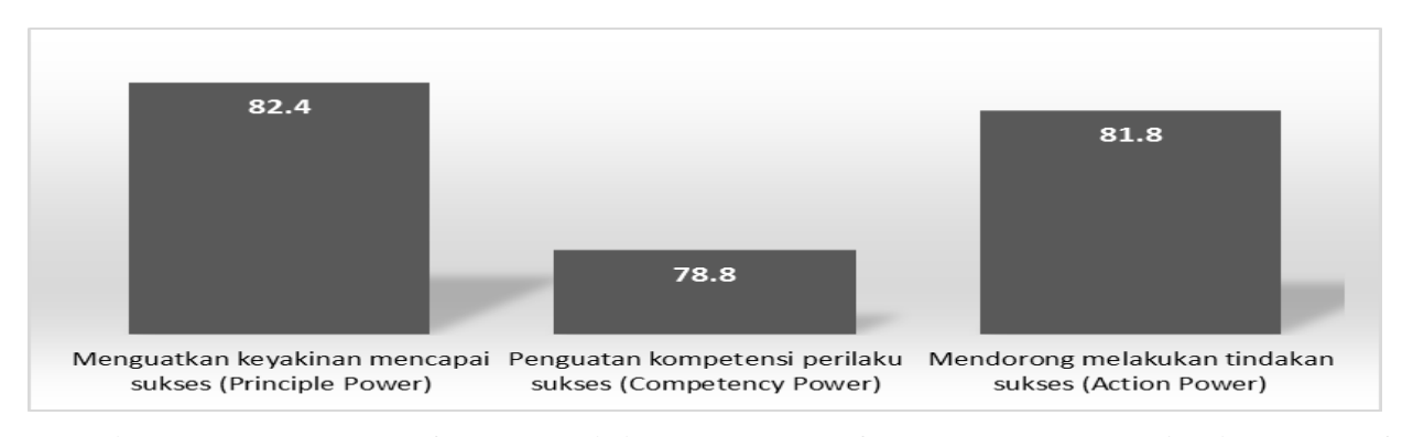
Figure 2. Percentage of HRD Training Program Influence towards the Achievement of Training Objectives in the Structure of Pumping HR model

This program has provided a great influence on the three important objectives of the pumping HR model-based HRD training program, namely: (1) the conviction of the participants to achieve success (pumping principle) through their current profession or position, (2) the strengthening of competencies to achieve success (pumping competency) through professional behaviour that is in accordance with working culture in IPB, and (3) the urge to perform successful actions (pumping action) in working and everyday social relations. Based on the results of the questionnaire of the training program influences the three important objectives mentioned above is as shown in Figure 2 below.